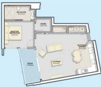
1 bedroom apartment