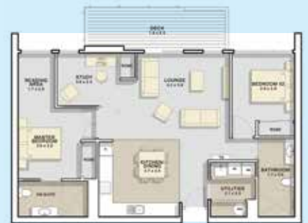
2 bedroom premium

For more information contact Frances Shaw on 09 929 5836