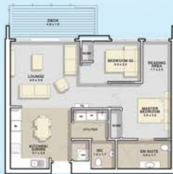
2 bedroom apartment